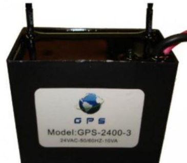
Global Plasma Solutions GPS-2400

Did you know GPS' independent testing shows Cold Plasma kills 99.6% of contaminants in less than 15 minutes in the space?